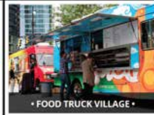
• FOOD TRUCK VILLAGE •