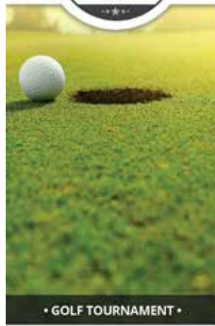
• GOLF TOURNAMENT •