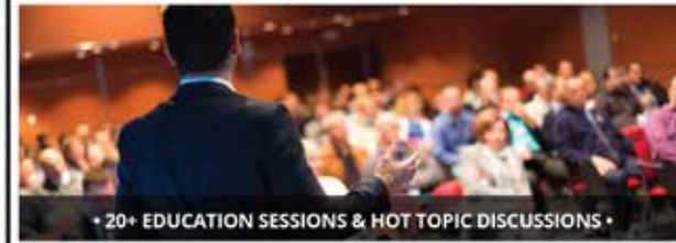
• 20+ EDUCATION SESSIONS & HOT TOPIC DISCUSSIONS •