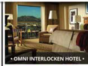
• OMNI INTERLOCKEN HOTEL •