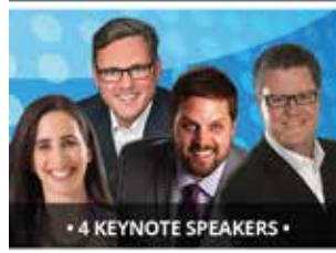
• 4 KEYNOTE SPEAKERS •