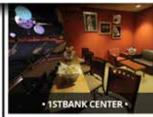
• 1STBANK CENTER •