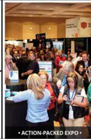
• ACTION-PACKED EXPO •