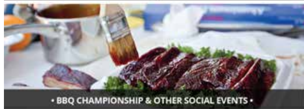
• BBQ CHAMPIONSHIP & OTHER SOCIAL EVENTS •